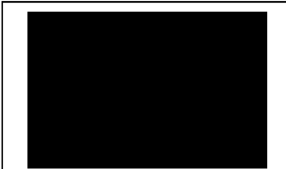
Not as quaint as it seems