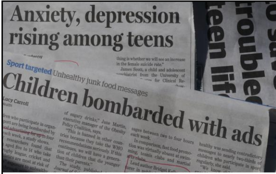
drugs & alcohol, sexualisation, obesity, screen time etc